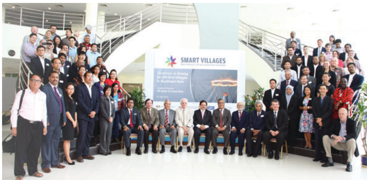
Dignitaries at official launch with workshop participants